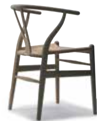
The iconic Carl Hansen & Son Wishbone chair by Hans J. Wegner is made of biodegradable untreated paper cord (for the seat) and Danish hardwoods sourced from sustainable forests. For every tree cut, five are replanted. Priced from $1,520, it's available at Space Furniture.