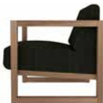
Ethnicraft's Teak Square Root chair is made in an Indonesian factory with FSC-certified timber sourced from Java, Indonesia. Any leftover teak scraps are recycled as finger joints for panelling. Priced at $975, it's available at Ethnicraft.